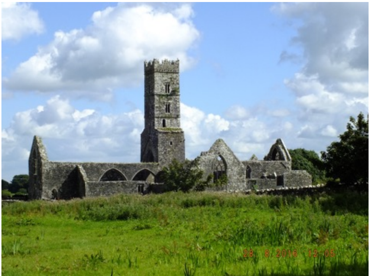
Kilconnell monastery built by Wm Bui Ó Ceallaigh in 1351.